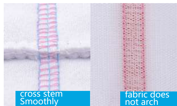
cross stem Smoothly