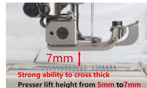
Strong ability to cross thick Presser lift height from 5mm to 7mm