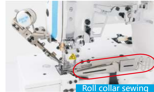
Roll collar sewing

Expand the range of sewing, mesh, thick underwear and other knitted fabrics can be applied