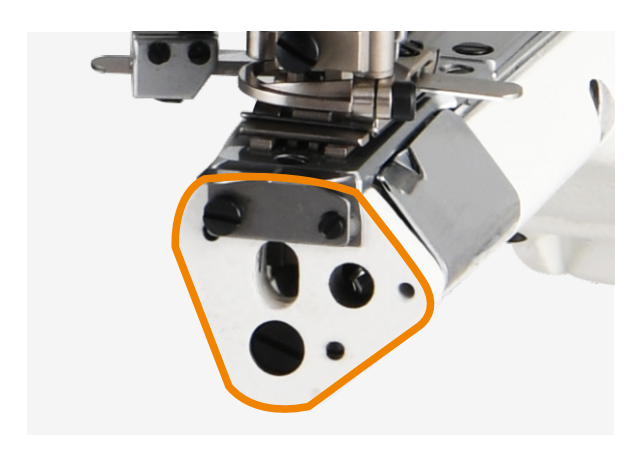
Small cylinder with 150mm circumference, which is smoother for sewing

This is the basic model for bending arm type four needle six thread attaching sewing machine. Optional AW rubbish suction device for smoother swing and more beautiful stitches.