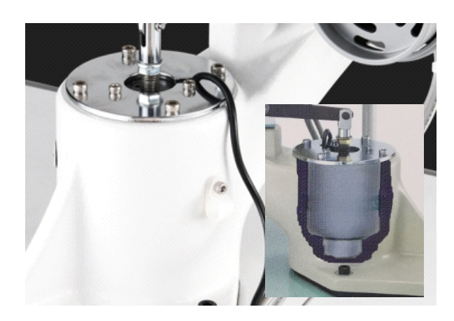
Standard automatic presser foot lifter, high efficiency