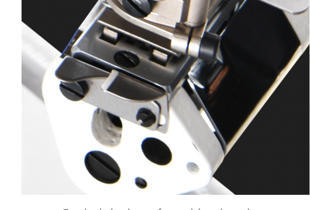
Sealed design of machine head, no oil trouble