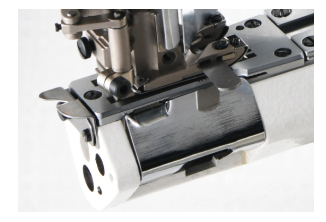
Spring-type presser foot structure, wide fabric adaptability