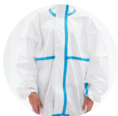
medical protective clothing

Hot-air seam sealing machine is mainly used for seam sealing. It is a glue reinforcement process. The adhesive tape at the seam is heated by the machine, and the pressure roller is continuously rotated to feed and pressurize, and the tape is closely adhered to the fabric, to prevent water, bacteria, viruses, air, etc. from intruding into the inner side through the seam to achieve protection. It is widely used for products such as medical protective clothing, waterproof shoes, diving suits, sports suits, mountaineering suits, waterproof bags, raincoats, tents and awnings etc.