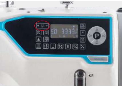
Thick and fine thread through cutting