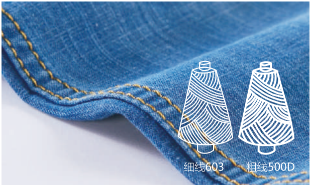
Thick and fine thread through cutting