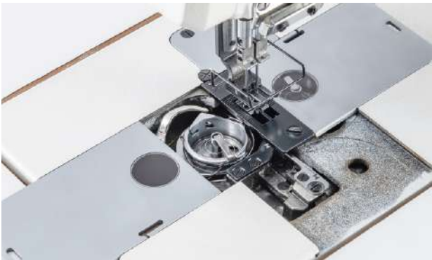
Cut the thread with a straight knife