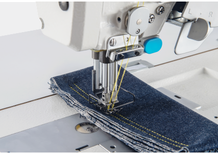
Electronic thread tension makes the stitches more beautiful